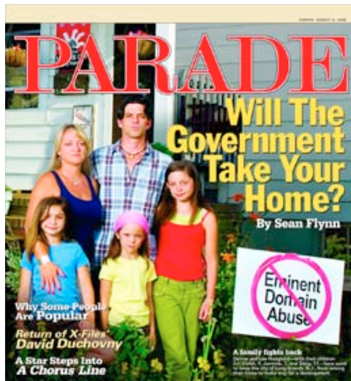
© 2006 Parade Magazine. Reprinted with permission.

In the mid-1990s, property rights activists adopted a third approach to state-based laws and crafted conflict resolution laws as "let's sit down and talk about it reasonably" laws. Two states (Maine and Florida) adopted this approach. But by the late 1990s some in the property rights movement began to question its strategy. Its leaders had been