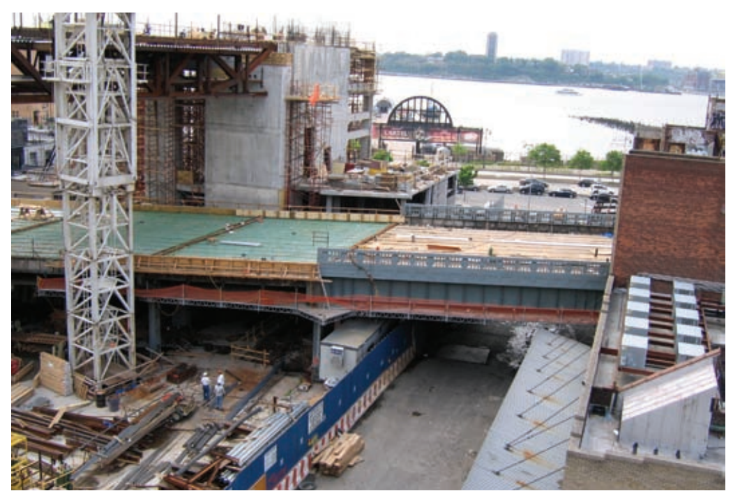
Enhancing the lower West Side of Manhattan, the Highline Greenway Park is being constructed on an abandoned elevated rail viaduct. This community project is managed by Friends of the Highline with many public and private partners.

Known for its spectacular scenery, outdoor recreation opportunities, and diverse natural habitats