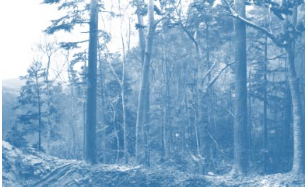
Diorama of the primeval New England forest at the Fisher Museum, Harvard Forest, Petersham, Massachusetts.

The United States is particularly blessed with forests. About one-third of its total land area (730 million acres) is woodland. The proportion rises to nearly two-thirds east of the Mississippi River. Contrary to prevailing public opinion, two out of every three acres of U.S. forest is in private, not governmental, hands. Some 9 million non-industrial private woodland owners control the future of these forests, a number that is rising steadily as land changes hands and is fragmented into smaller and smaller parcels.