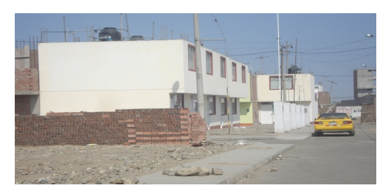
Figure 1—Single Family AVN Homes in "El Milagro" Housing Trujillo, La Libertad

There are also examples of housing projects combining more than one public program, namely NCMV and AVN (Landaure, 2010). Examples of such projects in Lima include Parques de El Agustino, which combined 3,200 homes of " Mi Hogar " (middle class) with only 100 AVN homes; Santa Rita, which combined FMV with AVN; and the proposed mega-project (if ever implemented) Ciudad del Sol de Collique (Comas), planned for 16,000 apartments, of which 5,000 would be AVN and 11,000 NCMV. The expectation is that projects of this magnitude would elicit a greater interest on the part of the banks.