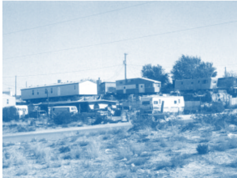
Vacant lots, self-built dwellings, campers and a trailer are part of the Sparks Colonia in El Paso.

Low income here refers to households earning between $12,000 and $25,000 a year, although many colonia households actually earn much less (see Table 1). These households are in poor labor market areas: either regions experiencing wage and labor polarization among workers, or where low-paid service sector jobs predominate.