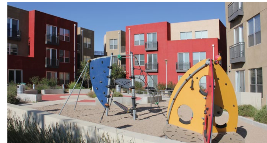
Above: Dudley Neighbors CLT in Boston provides affordable housing and community control of land on behalf of its founding organization, the Dudley Street Neighborhood Initiative (DSNI), freeing DSNI to focus on community planning and organizing.

Located in Albuquerque, New Mexico, Sawmill CLT was born in 1996 when, after a decade of community organizing, low-income residents banded together to fight a nearby factory that polluted their air and threatened their health.