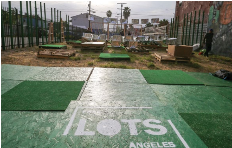
Vacant lots and deteriorated housing were rampant in South LA when the T.R.U.S.T. CLT formed in 2005 to revitalize the neighborhood and preserve affordable housing there.

Even the ongoing stewardship of a CLT requires a different kind of relationship with residents than an organizer would have. "Developer fees