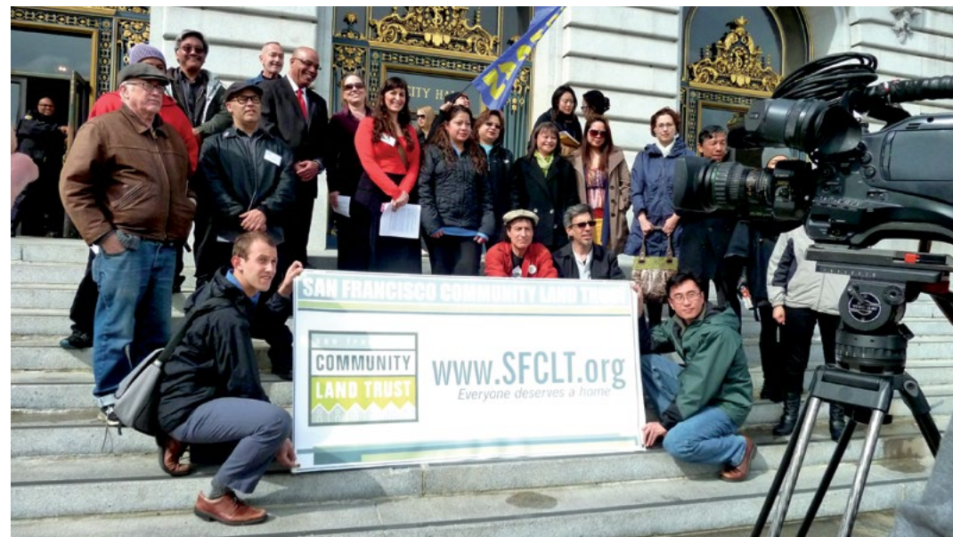
San Francisco CLT purchases small, at-risk apartment buildings and converts them to co-ops on CLT-owned land.