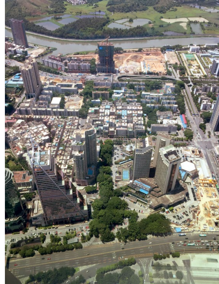
Most of the residential construction in Shenzhen's urban villages (rural settlements surrounded by modern development in Chinese cities) is SPR housing.

The municipal governments' ability to expand the urban land supply is heavily limited, however, by China's strict farmland preservation requirements. Under this policy, 1.8 billion mu (equivalent to 1.2 million sq. km) of high-quality agricultural land nationwide must be reserved for food security. The Ministry of Land and Resources annually approves the amount of urban land for