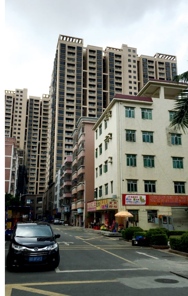
The shorter buildings in the foreground here are SPR housing built by villagers on their residential plots in Shenzhen, while the high-rises are SPR housing built by the village collective corporation, whose members share the profits.

Local governments, however, were more uncomfortable with the growing numbers of SPR housing units because they reduced demand for government-supplied residential land and therefore revenues from land concessions. But again, the fear of social unrest left most