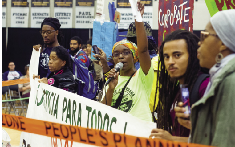
A coalition of neighborhood groups on the front lines of Boston’s displacement crisis protested at the national YIMBYtown conference held in the city in 2018.