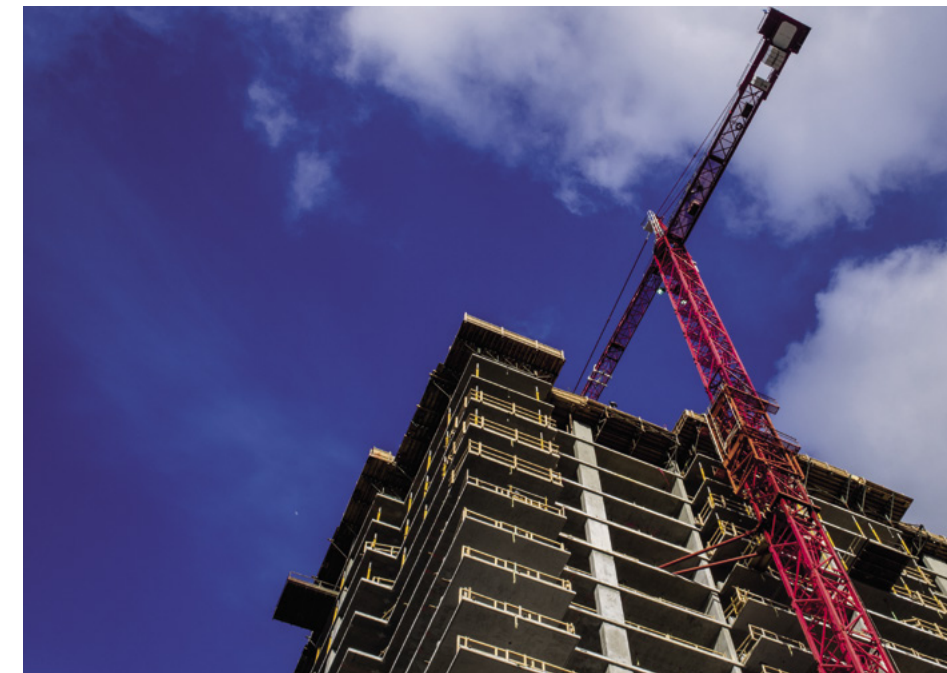
New residential construction in cities like Seattle increasingly comes with requirements that developers reserve a portion of the project for affordable housing.

“We need to focus on the big picture: cities like Seattle need to add as much housing as [they can] as fast as possible. People seem to get hung up somehow on the fairness of that . . . that landowners and developers are bathing in gold coins,” he said. The wave of tech jobs in such cities should be seen as a “gift,” he said, that will ultimately boost the entire city.