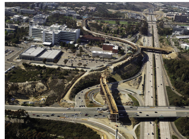
San Diego Mayor Kevin Faulconer has embraced the YIMBY approach, vowing to increase density along transit corridors.

Many cities are tying upzoning to affordability requirements such as inclusionary housing, where new residential development must include a percentage of affordable homes—or funding so that the same amount of affordable homes can be built elsewhere in the community.