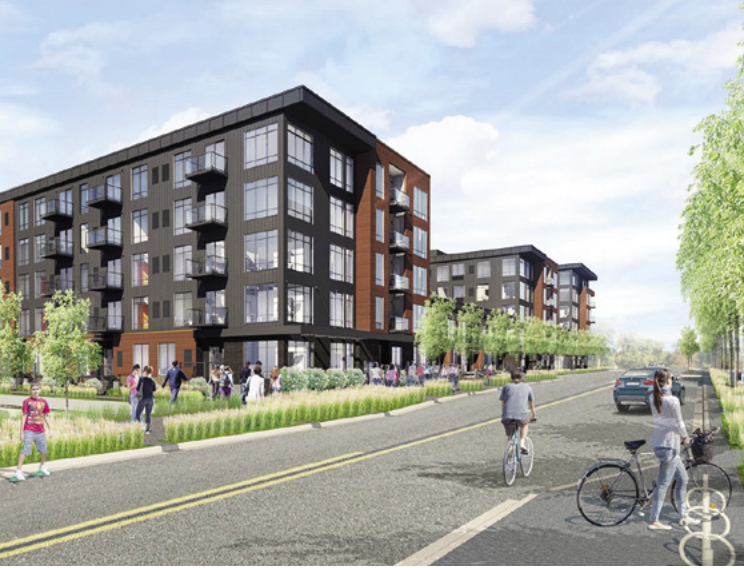
More than 25 percent of the units at Green on Fourth, a new apartment complex in Minneapolis, will be designated as affordable housing.