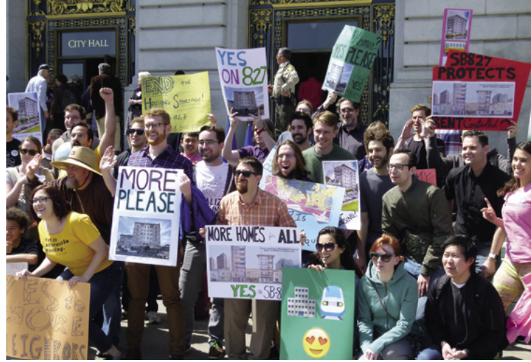
YIMBY advocates turned out for a rally in San Francisco to support SB 827 in 2018. The proposed legislation would have fast-tracked multifamily housing production around transit stations.

Land value capture is a policy approach that enables communities to recover and reinvest land value increases that result from public investment and other government actions. It's rooted in the notion that public action should generate public benefit.