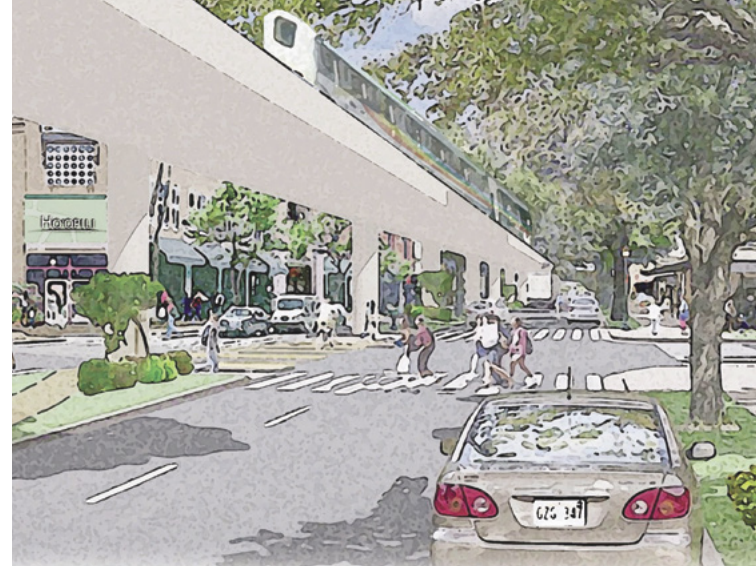
With a new rail line in Honolulu increasing property values along the route, affordability requirements will help ensure that the community sees benefits.

height and density see prices rise very quickly—before a single foundation is poured. That was the conclusion of an MIT study published in January 2019 in Urban Affairs Review , looking at land parcels and condominiums in catchment areas around transit stations in Chicago that had been rezoned for taller and denser buildings (Freemark 2019). An important caveat was that there was a lag in permitting and construction of new projects, so supply wasn't actually increased. But because the city signaled that density would increase, the research concluded that the "short-term, local-level impacts of upzoning are higher property prices."