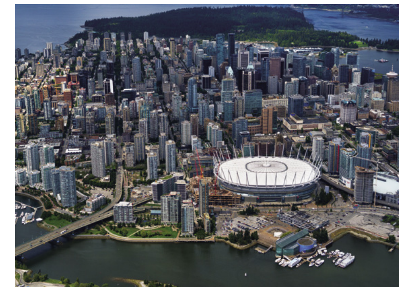
Vancouver, B.C., mandates developer contributions that fund affordable housing, bikeways, parks, childcare sites, and other amenities.