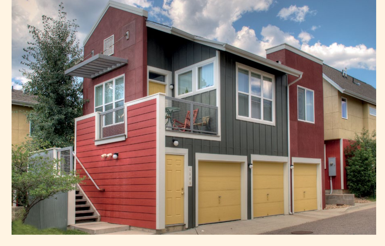
This carriage house ADU, in the mixed-use Holiday neighborhood, is part of Boulder Housing Partners' affordable rental program.