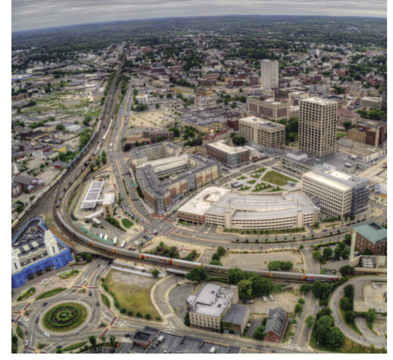
An aerial view of Worcester, Massachusetts.

Larger legacy cities across the country have embraced a suite of options with these goals in mind. In Detroit, a comprehensive green infrastructure effort has led to a citywide sprouting of green roofs, rain gardens, and a "green alley" program in which native plants and permeable pavers replace urban debris and concrete in previously neglected alleyways. In Cleveland, the regional sewer district manages a green infrastructure grants program, and ambitious plans are coming together for a park that will occupy