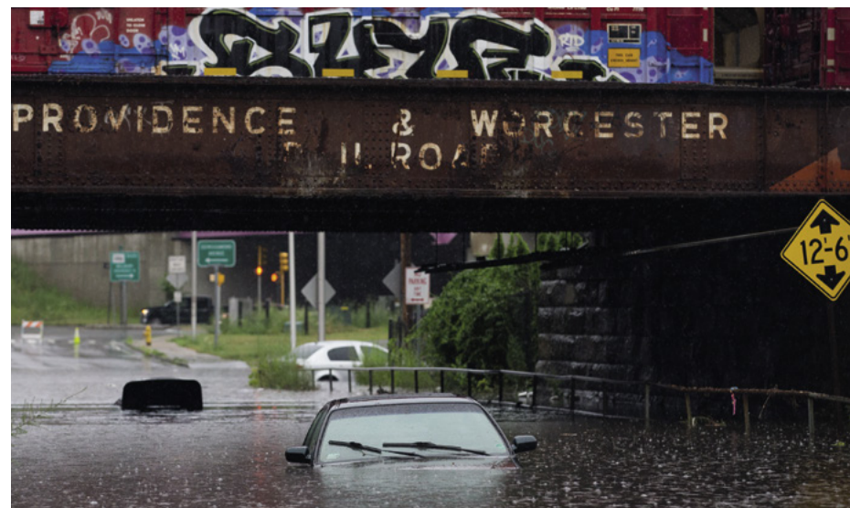
Figure 1 Providence and Worcester Population Trends, Key Industries, and Land and Water Area

Cars navigate heavy flooding under an aging Providence & Worcester Railroad bridge in Worcester in July 2018.