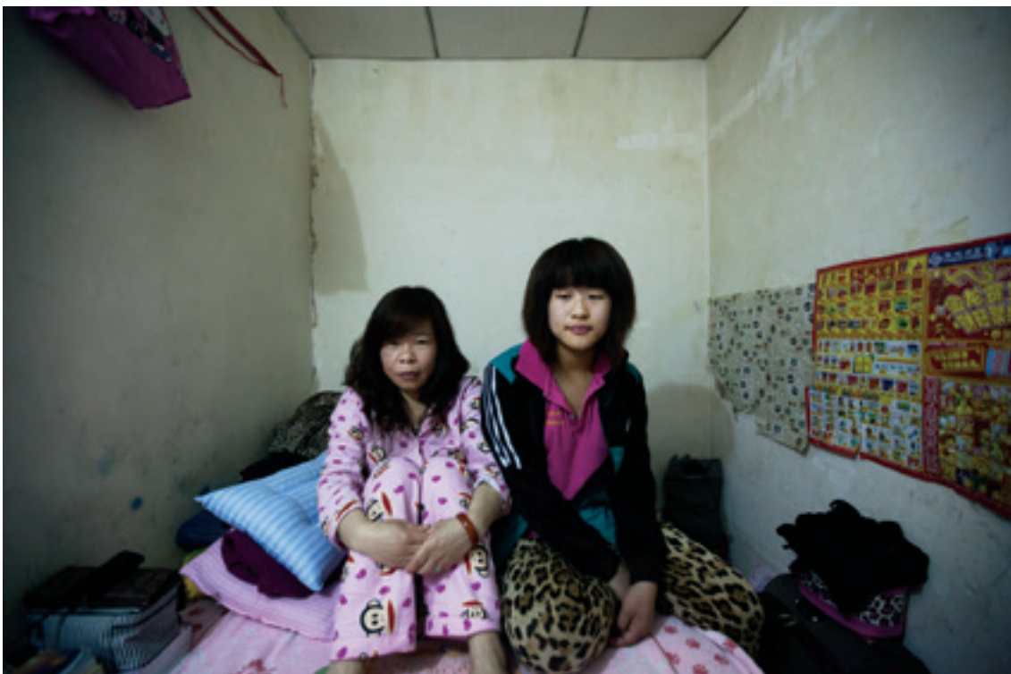
These mall workers are temporarily sharing a tiny, windowless, underground room in Beijing.

Some complexes contain as many as 600 units below street level. Roughly 50 percent of the advertised units are one or two stories underground.