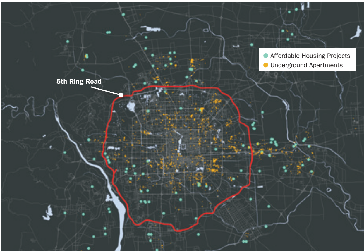
FIGURE 1 Distribution of Beijing's Affordable Housing Projects and Underground Housing

Number of observations = 3,677.