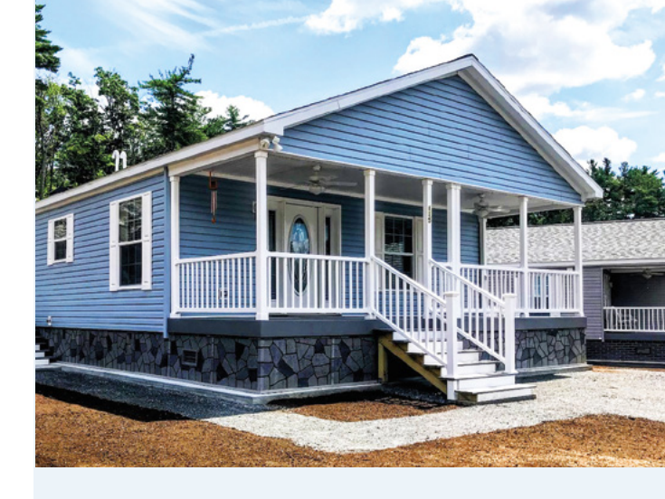
A manufactured home at Woodland Estates in Massachusetts.

They are also virtually absent from the chattel loan market, leaving it anemic and uncompetitive. "Currently, neither Fannie Mae nor Freddie Mac is