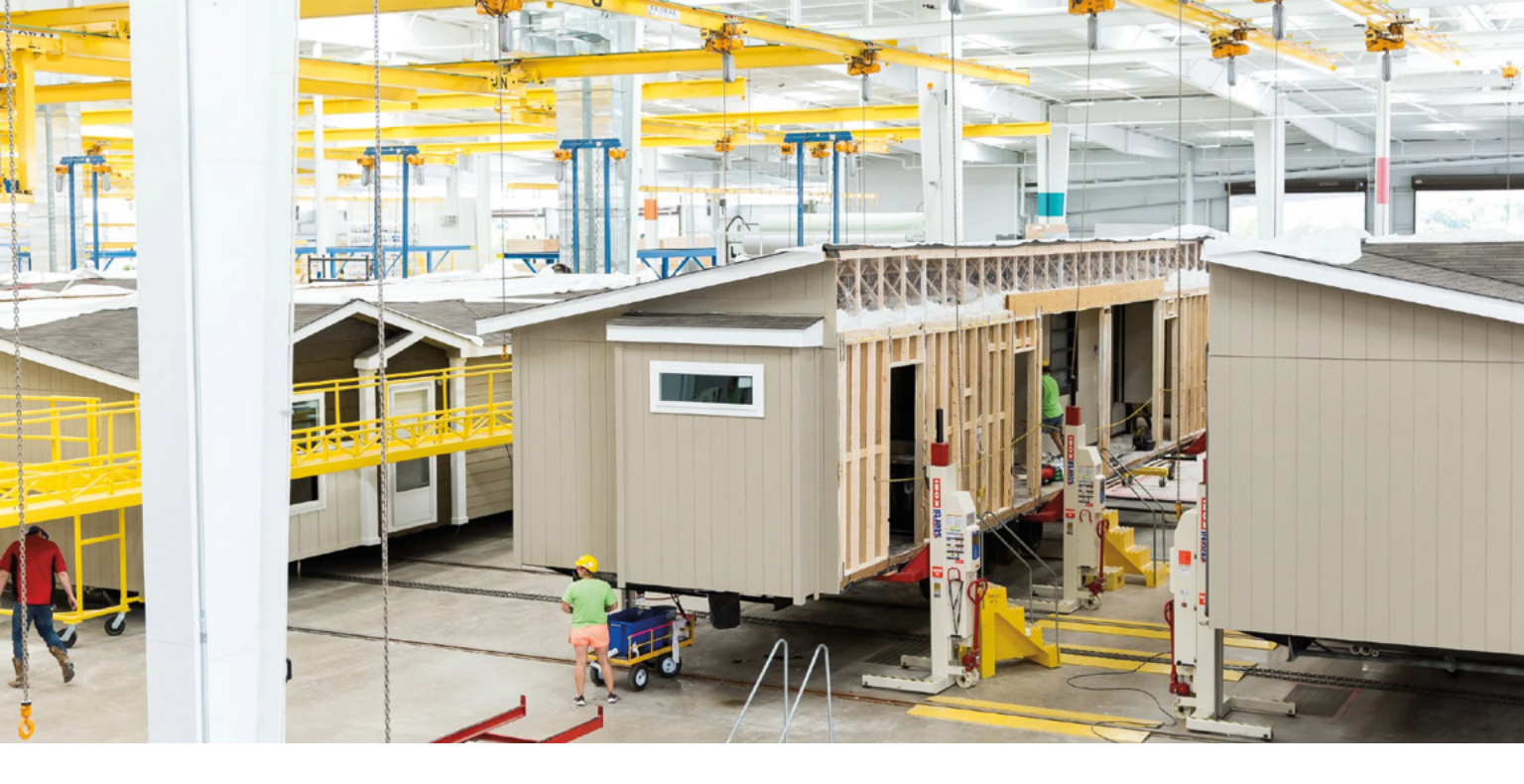
Manufactured homes under construction in a factory in Athens, Alabama.

manufactured home is under 1,500 square feet, according to Census data (U.S. Department of Commerce 2022).