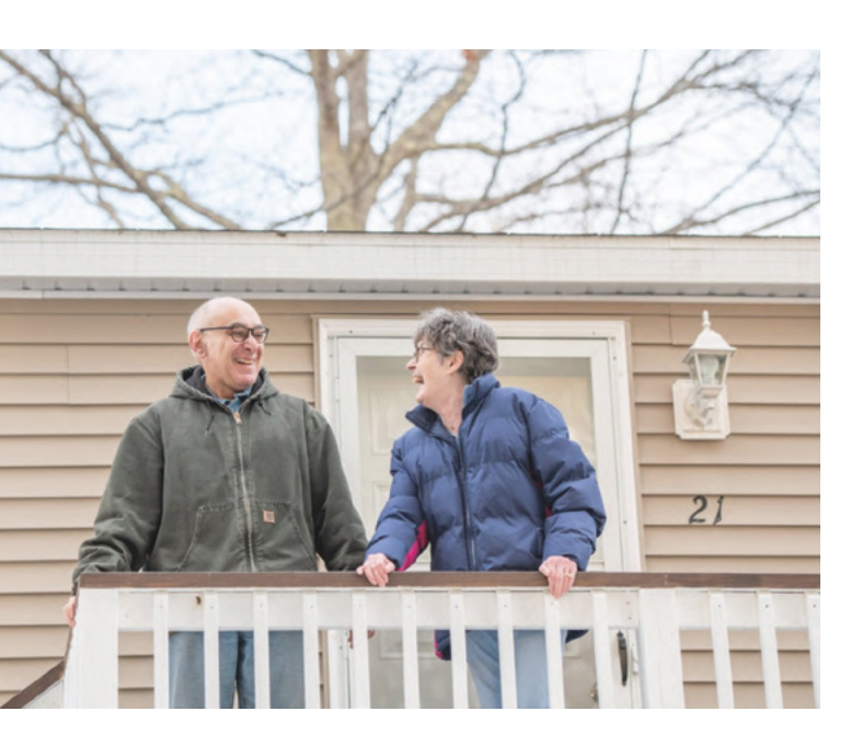
Homeowners at a resident-owned community in Maine.

Some municipalities will permit a one-time variance for manufactured housing construction, she says, while others open up their zoning rules to allow more going forward. City officials in Hagerstown, Maryland, approved a Next Step project in 2021, a 69-acre workforce housing development of 241 manufactured homes called Kilpatrick Woods. In 2022, Oakland, California, passed an ordinance allowing manufactured housing on any residential-zoned lot in the city.