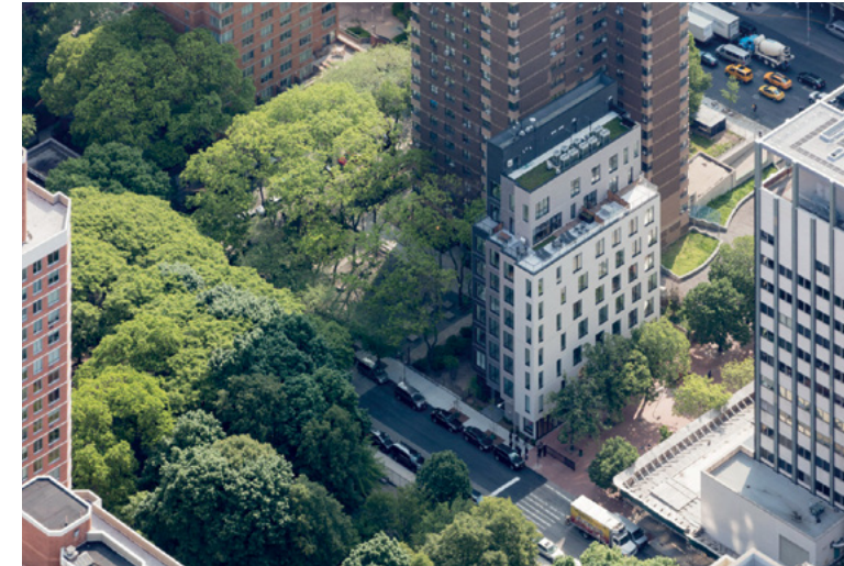
Carmel Place, New York's first micro-unit apartment building, features modular units that were built in a factory space at the Brooklyn Navy Yard (left), then pieced together on-site on a lot considered too small for traditional construction (right). Credit: nArchitects.

In its search for more land, the city is trying to unlock the potential of vacant lots long considered too small or irregular for traditional housing stock to be developed with innovative smaller homes, said Kapur. It is planning affordable housing for seniors on parking lots at existing Mitchell-Lama and HUD-regulated complexes. In highly transit-accessible areas, the city is enabling the development of mixed-income buildings for small households, including studios and units with shared cooking spaces, and is relaxing some zoning restrictions on apartment size. The city is also looking at reclassifying residentially zoned vacant lots to increase the owners' tax bills and incentivize them to develop the sites for housing.