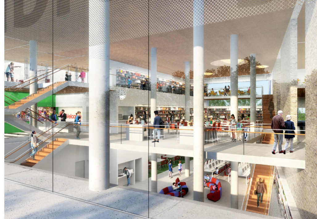
The Eliza, an affordable-housing hybrid under development in the Upper Manhattan neighborhood of Inwood, represents a partnership between the city, the New York Public Library, community groups, and an affordable-housing developer.