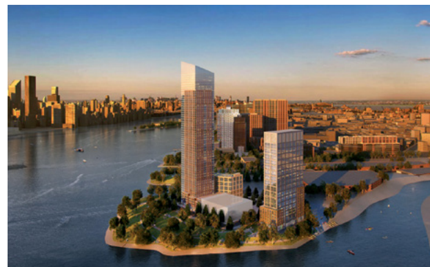
Projects such as the Dinsmore-Chestnut building in East New York, top, and the Hunter’s Point complex in Queens, bottom, are part of the city’s ambitious effort to expand its affordable housing stock.