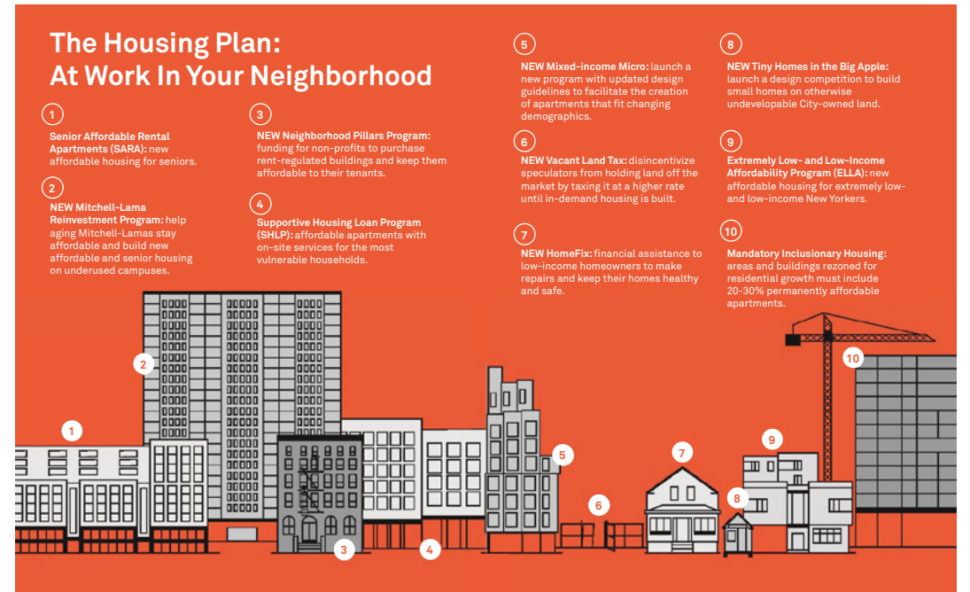
The Housing New York 2.0 plan spells out some of the city's ambitious goals, including affordable housing for seniors, mandatory inclusionary zoning, and a vacant land tax.

The city tries to place people close to their support networks, in the communities they call home, to improve the odds of quickly stabilizing lives. It also provides dedicated facilities for families, men, women, unaccompanied youth, and LGBTQ residents. In 2017, New York City spent $1.7 billion in city, state, and federal money to aid its homeless population.