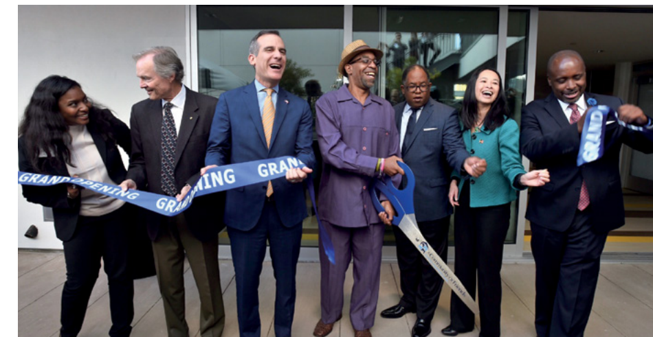
Los Angeles Mayor Eric Garcetti, third from left, at the 2017 ribbon-cutting for Silver Star Apartments, a 49-unit development for homeless veterans. The project was funded in part by Measure HHH, a voter-backed initiative that committed $1.2 billion in bonds to build 10,000 units of permanently affordable housing over 10 years.

Beyond emergency shelters, the city is using funds from Measure HHH, a ballot initiative that three-quarters of LA voters passed in November 2016, committing the city to raising $1.2 billion in bonds for construction of 10,000 units of permanently affordable housing in the next decade. The city will spend more than $238 million of HHH funding this year to build 1,500 new homes at 24 project sites. In April, the city council approved two additional programs to support the effort to increase the city’s affordable housing base: one streamlines the development process for projects that include supportive affordable housing, and another allows LA’s 10,000 motel rooms, many of them old and in poor shape, to be converted into affordable housing with supportive services. Finally, in one of the more creative approaches to both homelessness and land use, the city has launched a pilot program that offers financial support to homeowners in some single-family neighborhoods who agree to build or upgrade small dwellings in their backyards for the purpose of housing people who don’t have homes.