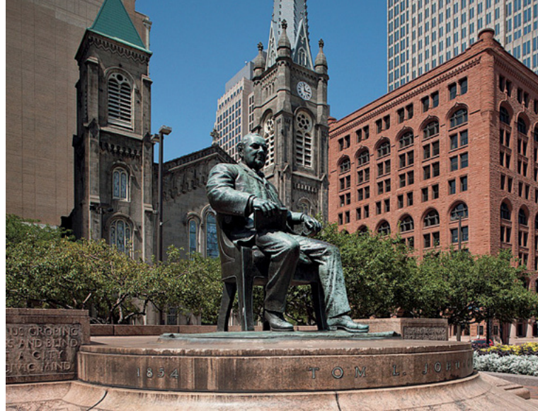
Statue of former Cleveland Mayor Tom Johnson holding the book Progress and Poverty.

And eight miles offshore from Cleveland, the city where the electric wind turbine was invented in 1888, the Lake Erie Energy Development Company wants to build North America's first freshwater wind farm.