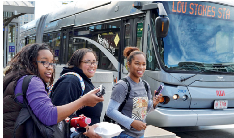
Students from Cleveland State University at a stop on the HealthLine, a Bus Rapid Transit system that connects their college with other schools, hospitals, and neighborhoods.