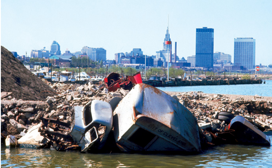
A partially submerged truck in Lake Erie, 1968. The truck is labeled City of Cleveland .

The fire and the conditions that led to it inspired a radically new approach to urban waterways, leading to the formation of the Environmental Protection Agency in 1970 and the passage of the Clean Water Act two years later. In Ohio, local leaders also developed the Northeast Ohio Regional Sewer District (NE-ORSD), a multijurisdictional management system that helped address industrial discharge and improved wastewater treatment.