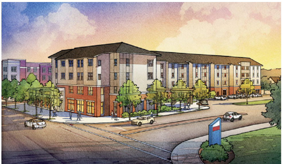
Cleveland Development Advisors is investing in three neighborhoods that have struggled with disinvestment and concentrated poverty. This architectural rendering shows affordable housing planned for the Clark–Fulton neighborhood. Credit: RDL Architects.

"Community is pretty much the biggest cornerstone of what we do here. Without the community, you don't have anything to build off of."