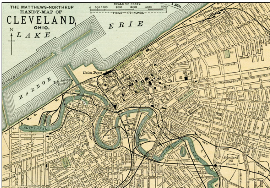
Map of Cleveland, 1898.

During the first half of the 20th century, the city drew hundreds of thousands of newcomers, including a surge of immigrants from southern and Eastern Europe in the early decades and, in the 1920s and 1930s, thousands of Black migrants from the South. To promote continued growth, the local electric company coined a slogan in 1944: "The Best Location in the Nation." The population continued booming until it peaked at 914,000 residents in 1950, making Cleveland the seventh-largest city in the country.