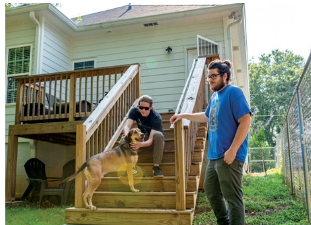
The Atlanta Land Trust has helped these and other local residents attain and sustain homeownership. The organization is now partnering with the Fulton County/City of Atlanta Land Bank Authority to identify new opportunities to create and preserve affordable housing options.