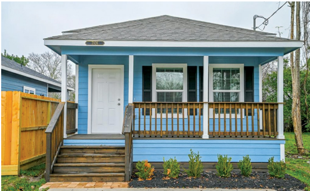
In Houston, where the median home price for a single-family home is about $250,000, a partnership between the city, the local land bank, and the Houston Community Land Trust is expanding the stock of available affordable housing. Credit: HCLT.

The HCLT is also focused on another important element, Allen said: climate proofing homes. The land trust educates homebuyers about climate resilience and serves as a check on affordable housing developers that might otherwise build on floodplains.