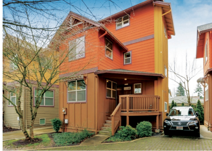
A Proud Ground home in Portland, where a proposed light-rail expansion could affect thousands of housing units.

Explaining the concept of shared equity can be a challenge. Some residents question the ground lease restrictions that limit resale value and wonder whether this prevents people from fully reaping the traditional benefits of homeownership. Linn explained that Portland’s resale formula aims to maximize the benefits for