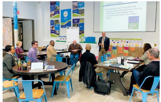
Construction of Atlanta's 22-mile BeltLine has prompted the Atlanta Land Trust to identify key focus areas for ensuring affordable housing (above) and accelerate strategic planning efforts (below).

Fulton County/City of Atlanta Land Bank Authority and a board member of the ALT.