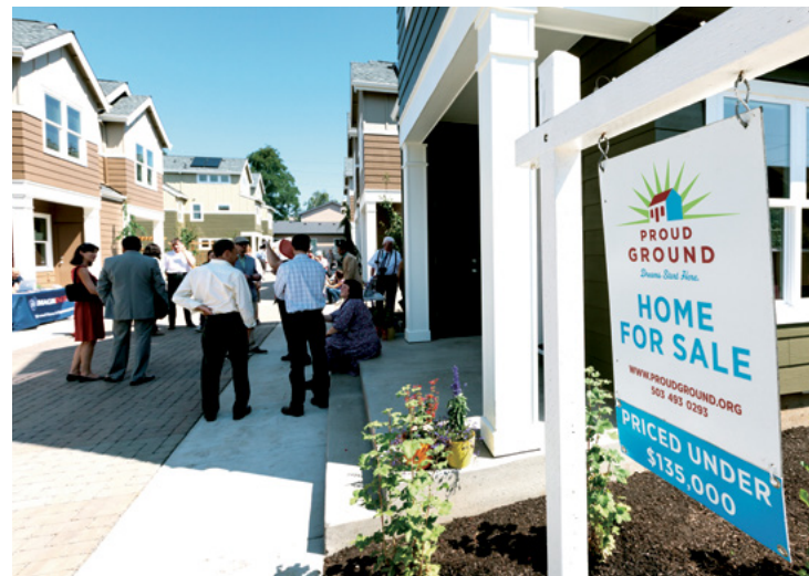
Proud Ground, the community land trust in Portland, Oregon, maintains a portfolio of 350 affordable homes.